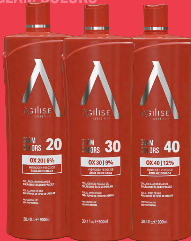
HYDROGEN PEROXIDE (DEVELOPER) 900ML 20 | 30 | 40 VOL.