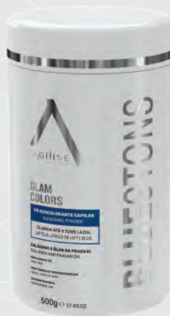
BLUE9TONS BLEACHING POWDER 500G

Semi Di Lino | Permanent Coloring | Shader