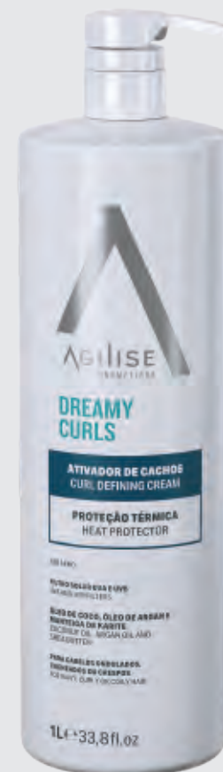
DREAMY CURLS CURL DEFINING CREAM 1000ML

Humidifying | Curls | Treatment | Nourishment