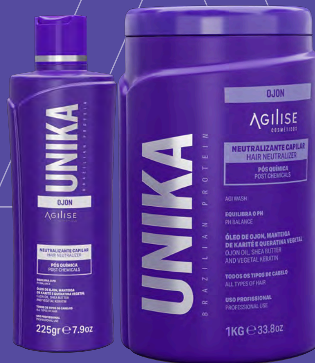
UNIKA HAIR NEUTRALIZER 1KG | 225GR