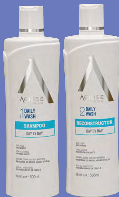
DAILY USE | SHAMPOO | RECONSTRUCTOR 500ML | 500ML