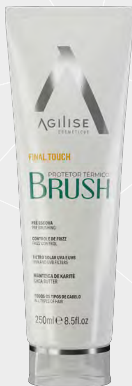
HEAT PROTECTOR 250ML