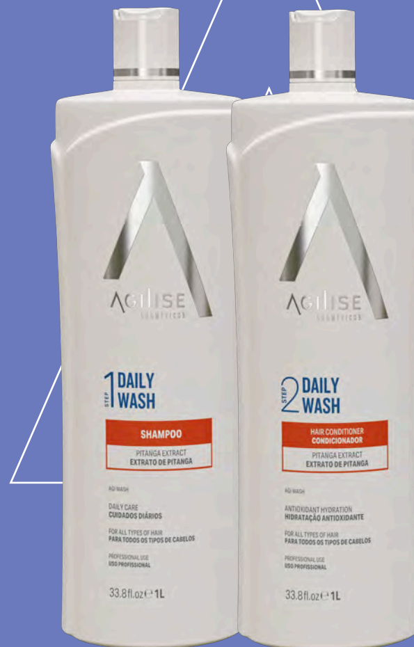
PITANGA EXTRACT | SHAMPOO | CONDITIONER 1000L | 1000ML