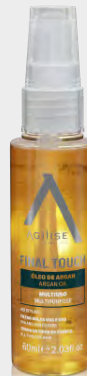
ARGAN OIL 60ML

Thermal Protector | UVA and UVB Protection | Solar Protection