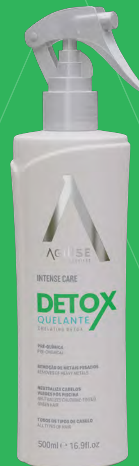
DETOX QUELANTE 500ML