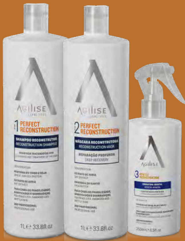
RP RECONSTRUCTION SHAMPOO | MASK | VEGETAL KERATIN 1000ML | 1000ML | 250ML

Hs Code: 33051000 Hs Code: 33059000 Hs Code: 33059000