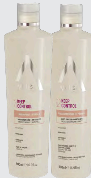
K1 PÉROLA HOME CARE SHAMPOO | RECONSTRUCTOR 500ML | 500ML