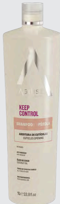
K1 PÉROLA ANTI RESIDUE SHAMPOO 1000ML