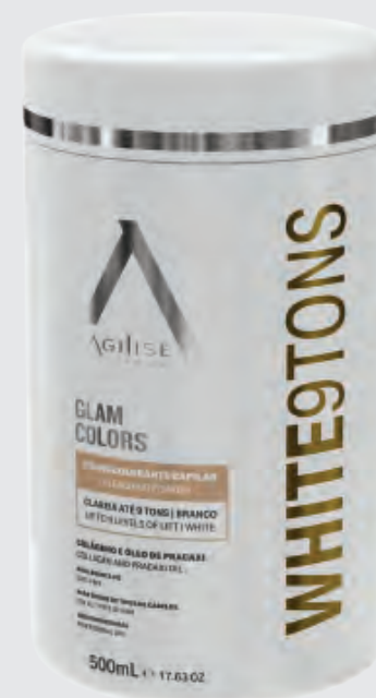
WHITE9TONS BLEACHING POWDER 500G

Several techniques | Dust-free Fast Bleaching | Uniform Elasticity and resistance control