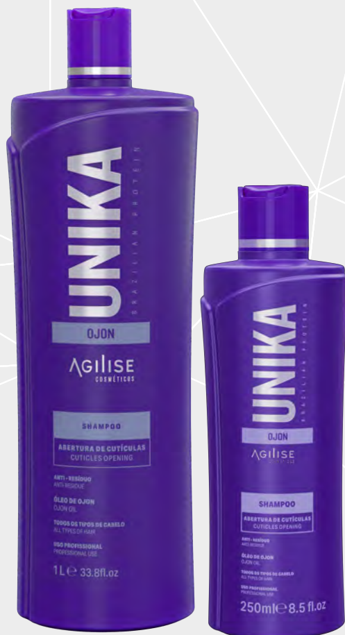
UNIKA ANTI RESIDUE SHAMPOO 1000ML | 250ML