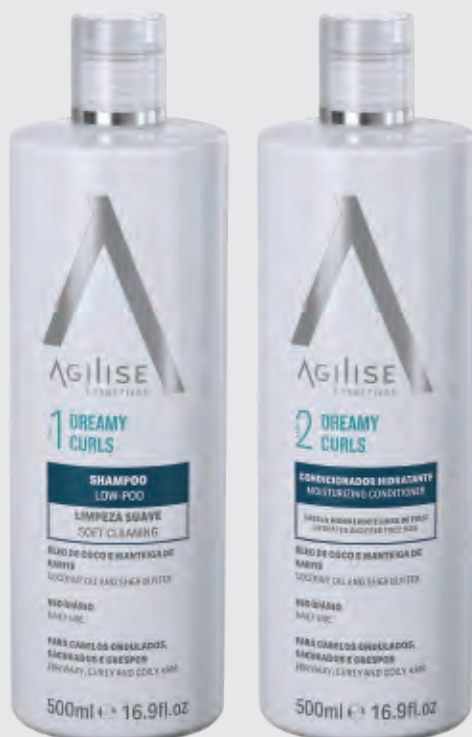
DREAMY CURLS SHAMPOO | MOISTURIZING CONDITIONER 500ML | 500ML