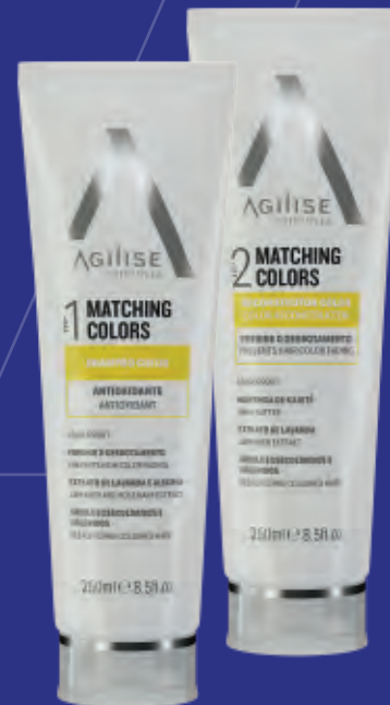
COLOR SHAMPOO | RECONSTRUCTOR 250ML | 250ML