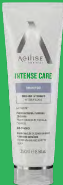
CARE SHAMPOO 250ML