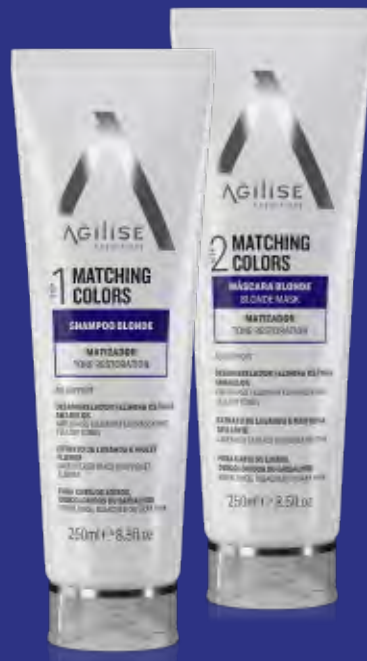
BLONDE HOME CARE | SHAMPOO | MASK 250ML | 250ML