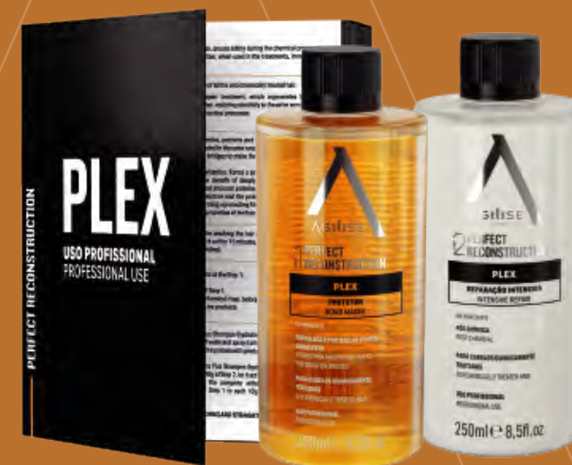
PLEX - STEP 1 | STEP 2 250ML | 250ML

Intracellular | Repair | Treatment | Capillary schedule