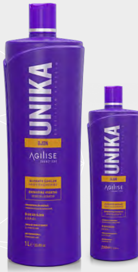
UNIKA OJON HAIR STRAIGHTENING 1000ML | 250ML

Anti Residual | Vegan | Professional use