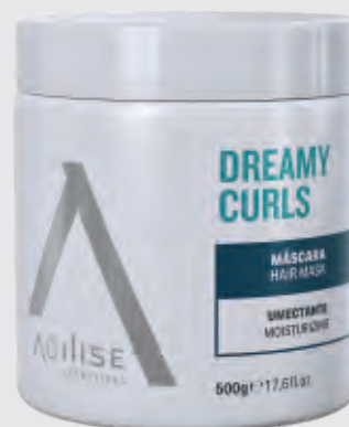
DREAMY CURLS HAIR MASK 500G