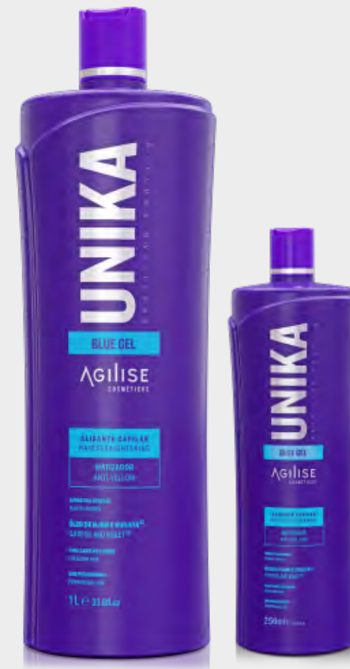
UNIKA BLUE GEL HAIR STRAIGHTENING 1000ML | 250 ML

Straightening | Vegan | Professional use.