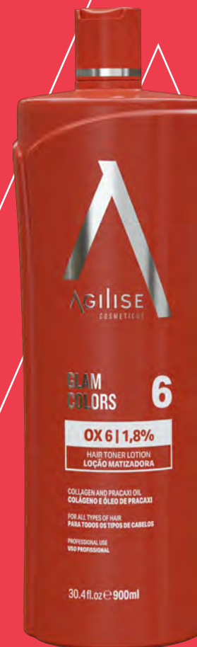
HAIR TONER LOTION 900ML

Recommended for coloring procedure which has as its goal enlightening or darkening the hair. Has Pracaxi Oil and collagen, that nourish and strengthen the hair. Bleaching | Coloring