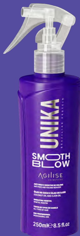
SMOOTH BLOW 250ML