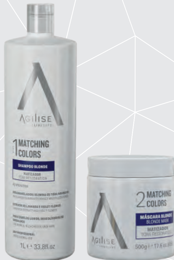
BLONDE PROFESSIONAL | SHAMPOO | MASK 1000ML | 500G