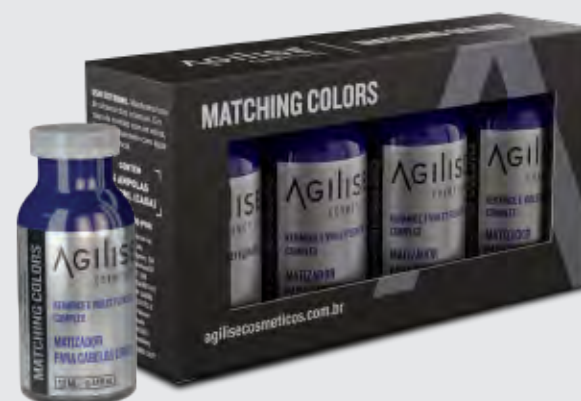
TONE RESTORATION AMPOULE – BOX WITH 4 12ML