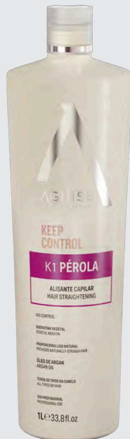
K1 PÉROLA HAIR STRAIGHTENING 1000ML