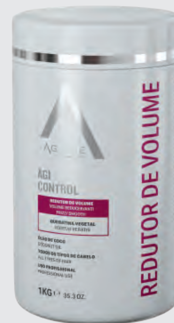
VOLUME REDUCER 1KG

Home Care | Post straightening | Chemically treated