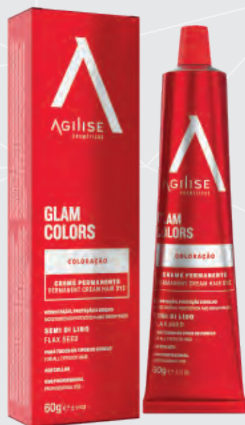
PERMANENT HAIR DYE 60G