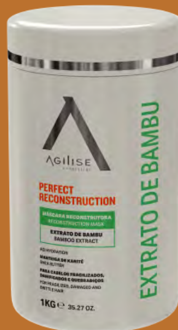
BAMBOO EXTRACT - RECONSTRUCTION MASK 1KG