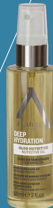
NUTRITIVE OIL 60ML

Antioxidant | Treatment | Capillary Schedule