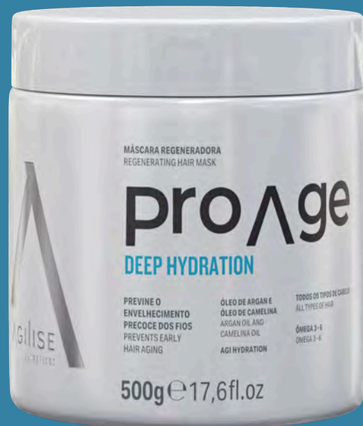
PRO AGE REGENERATING MASK 500G